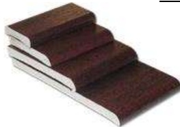
Vandyke Brown BS08B29