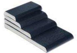
Anthracite Grey RAL 7016