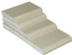
Off White RAL 9010 Cream RAL 9001 Traffic White RAL 9016 Ivory RAL 1015

This can also be purchased as an optional extra as follows. 27mm / 40mm / 60mm / 90mm